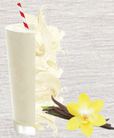
Vanilla 18 AED