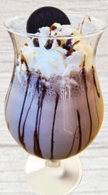
Oreo Peanut Butter 22 AED