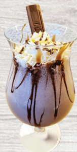
Choco Kitkat 22 AED