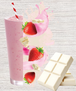
Strawberry & White Chocolate 18 AED