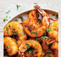
Shrimp AED 9/-