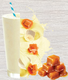
Banoffee 18 AED